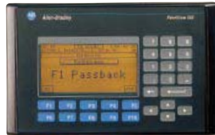
Sterile side, User-panel