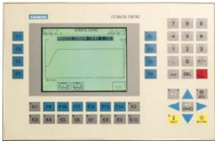
Non-steriled side, User-panel