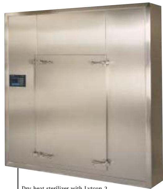
Dry heat sterilizer with Lytcon 2 Allen-Bradley PLC, sterile side.