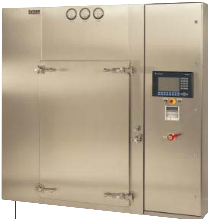
Dry heat sterilizer with LYTCON 2, Allen-Bradley PLC. Non-sterile side.

It is possible to acquire assistance from Lytzen for completion of IQ, OQ and PQ-documents.