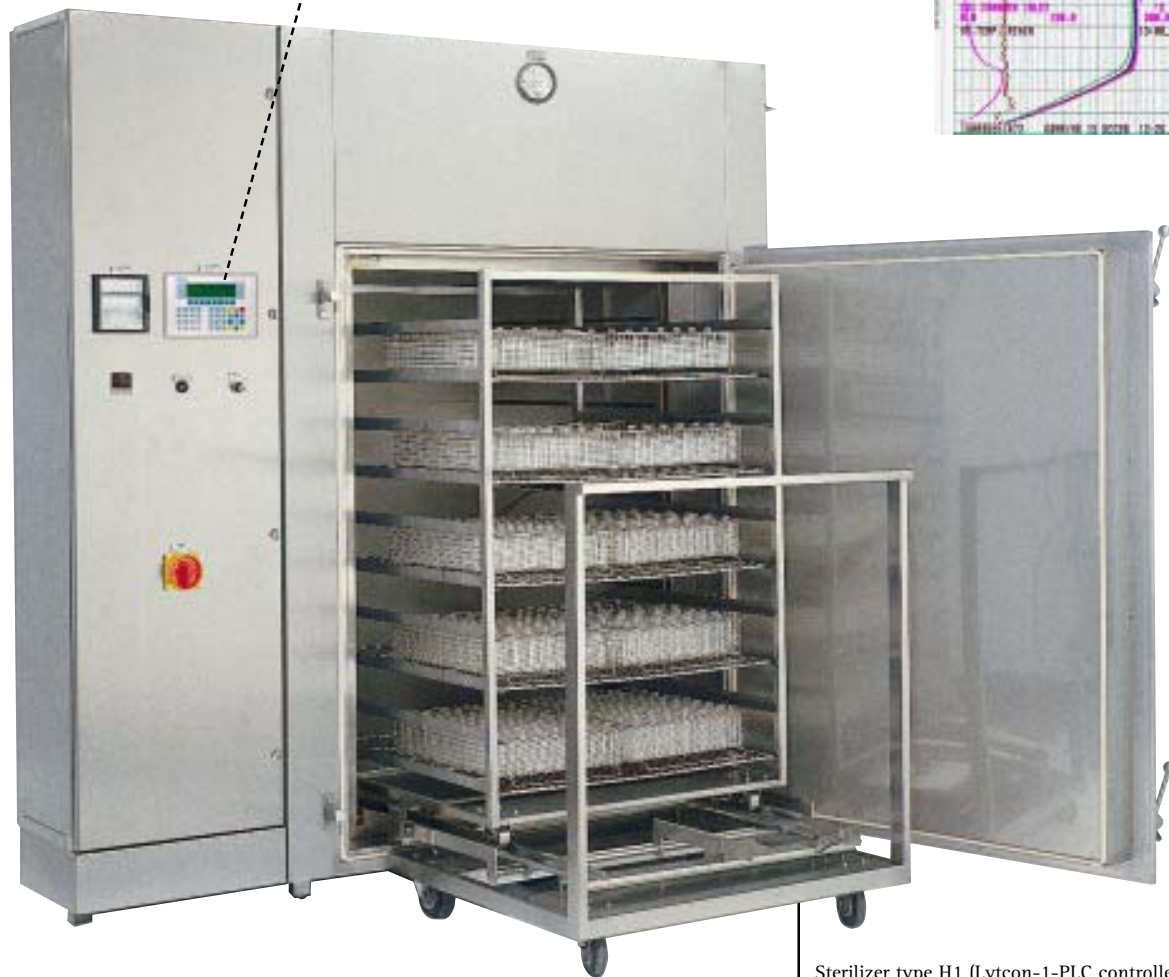
Sterilizer type H1 (Lytcon-1-PLC controlled) seen from non-sterile side. Here the sterilizer is shown during loading with glass bottles. Mobile racks are transported on transfer trolleys.