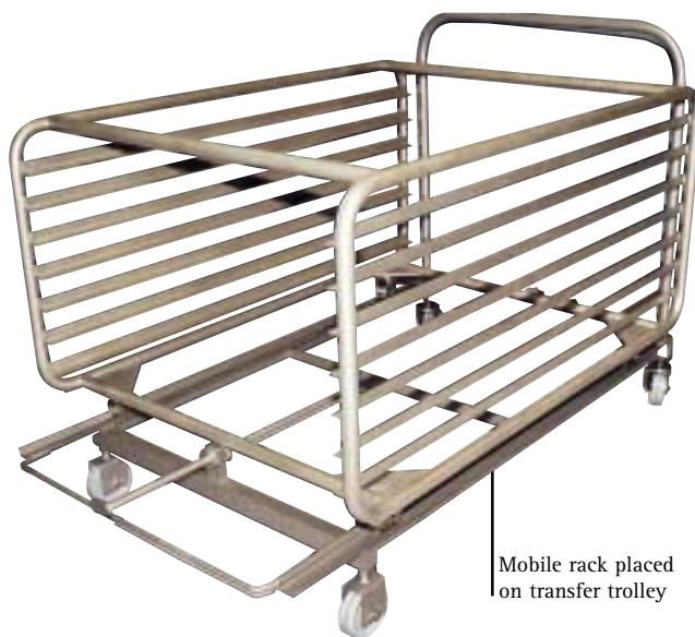
Mobile rack placed on transfer trolley