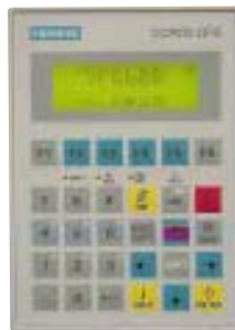
Sterile side, User-panel