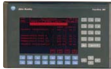
Non-sterile side, User-panel