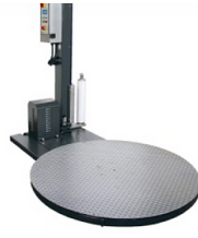
PP-981HP (High Profile) Pallet Wrapper